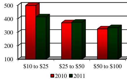
Transaction Volume by Size TTM Ending September 30, 2011

The number of reported transactions in the $50 to $100 million enterprise value category rose 2.8% compared to the prior year. Transactions in the $25 to $50 million enterprise value category increased 1.1%, while transaction volume in the smallest category ($10 to $25 million) fell 16.9%. The number of deals with undisclosed values (70% of all deals) increased by 16.7%. It is highly likely that most of these deals are under $100 million in value.